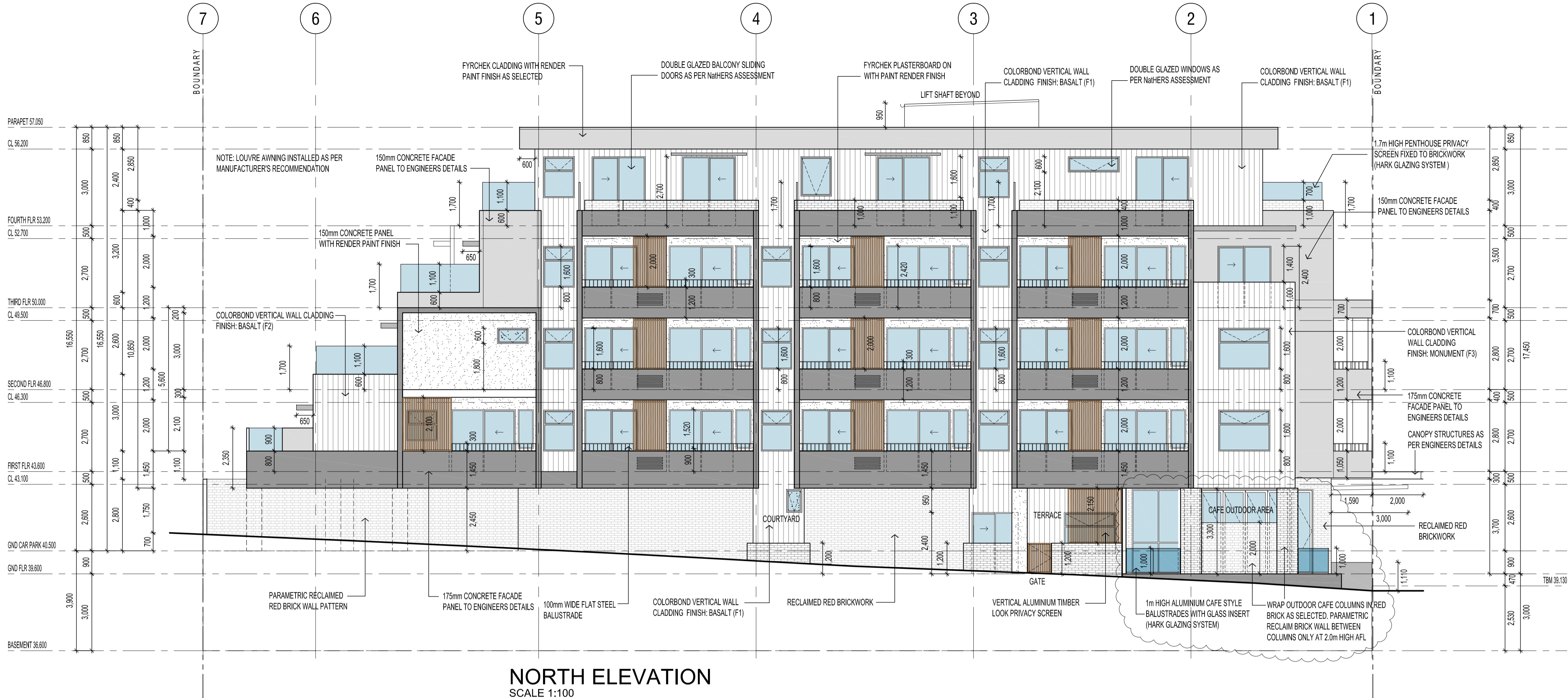
NORTH ELEVATION SCALE 1:100

WINDOW ACCESS CLEANING/MAINTENANCE NOTE ANCHORAGES FOR SAFETY HARNESSES SHALL BE DESIGNED AND INSTALLED IN ACCORDANCE WITH AS/NZS 1891.4 AND BE CONSTRUCTED OF CORROSION RESISTANT METAL